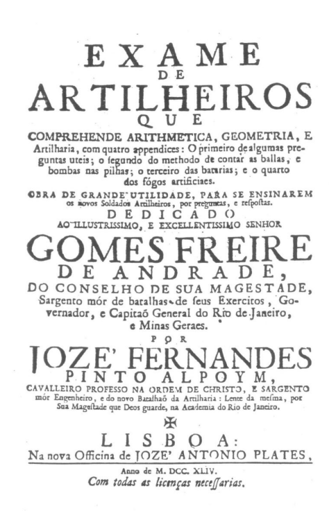
Fig. 1: Alpoim – Exame de Artilheiros - 1744

Another point to be distinguished in the history of mathematics in the Brazilian colonial time is the period that the Portuguese needed to have a better formation of their soldiers and officials. In the 17<sup>th</sup> and 18<sup>th</sup> centuries, military schools were created with the intention of giving instructions to the soldiers and officials of the safety forces of the country. For this reason, José Fernandes Pinto Alpoim (1700-1765),а military engineer, published in 1744 the first mathematics book written in Brazil, Exame de Artilheiros (Artillery), followed in 1748 by another work, Exame de Bombeiros (Bomb). Both were printed in Europe, Lisbon and Madrid, respectively, because there was no press in colonial Brazil. They are elementary books in an innovative methodology, with the objective of preparing for the admission exams to the military career, as it is suggested in the titles. Alpoim was formed at Coimbra University, as so were great part of the Brazilian intellectuality at that colonial time.