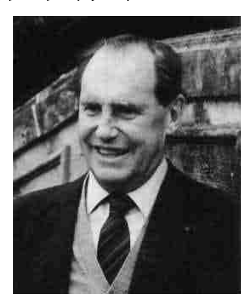
Fig. 6: André Weil